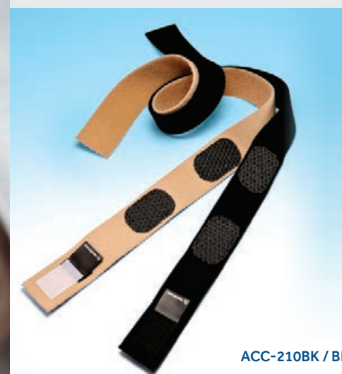
ACC-210BK / BE