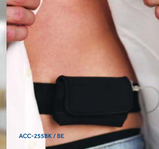
ACC-255BK / BE