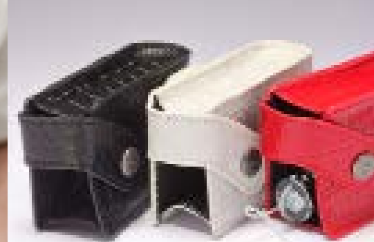
ACC-802BK ACC-802GY ACC-802RD