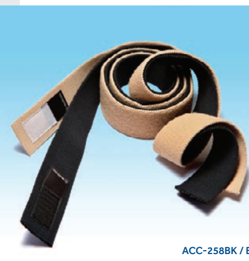
ACC-258BK / BE