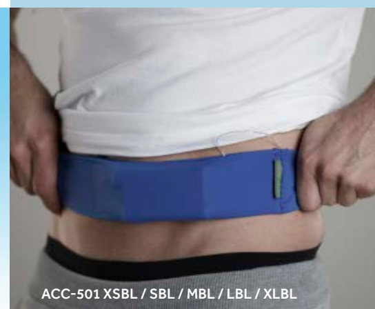
ACC-501 XSBL / SBL / MBL / LBL / XLBL