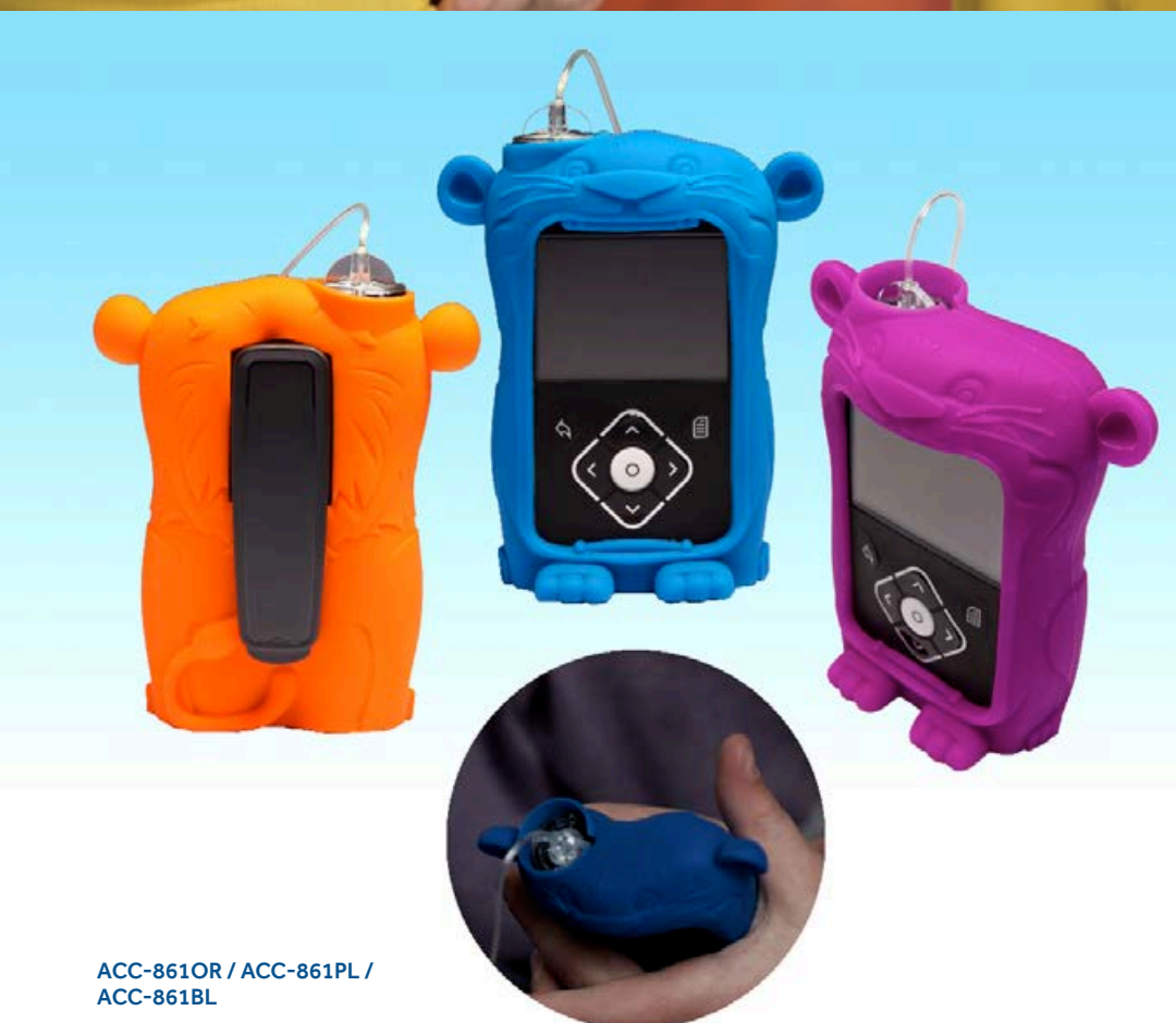
ACC-861OR / ACC-861PL / ACC-861BL