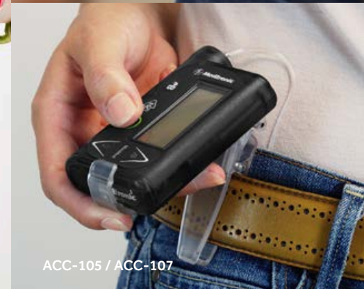
ACC-105 / ACC-107