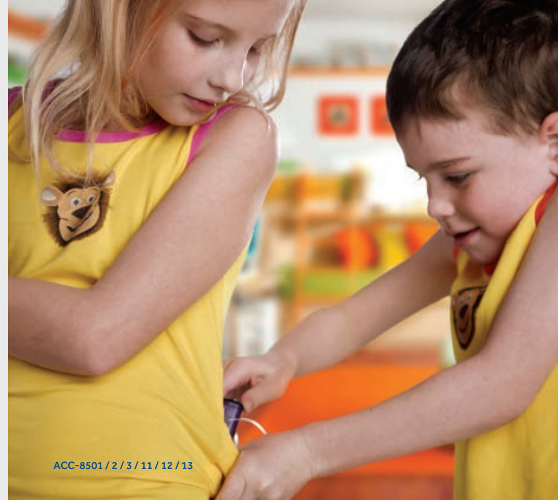
ACC-8501 / 2 / 3 / 11 / 12 / 13

Set of 4 kids appliques to style the denim case (ACC-260).