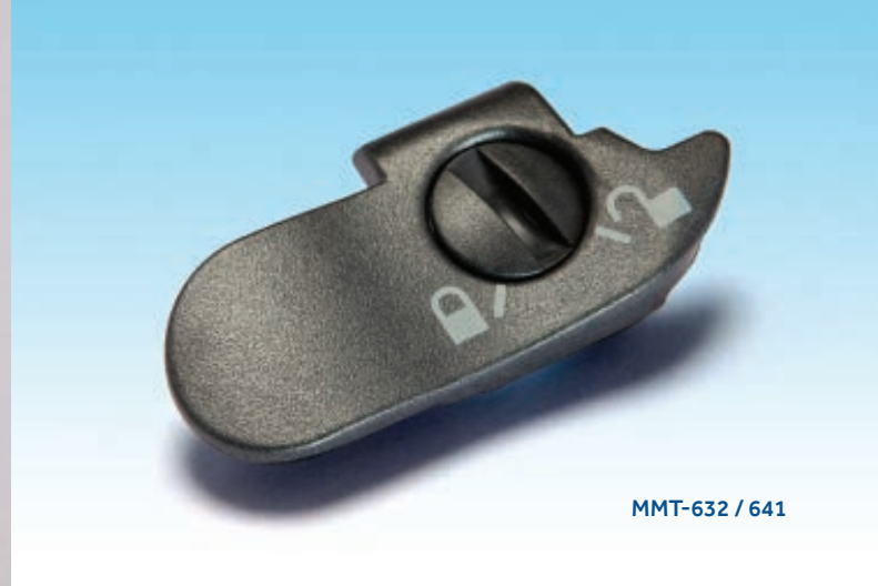
MMT-632 / 641