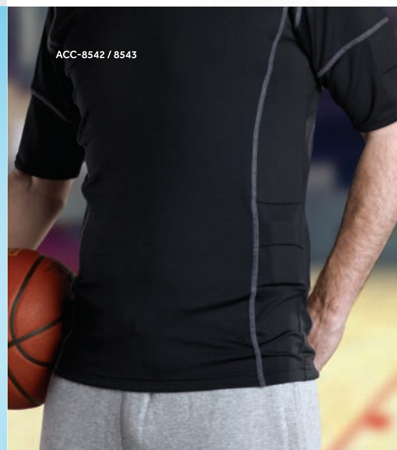
ACC-8542 / 8543