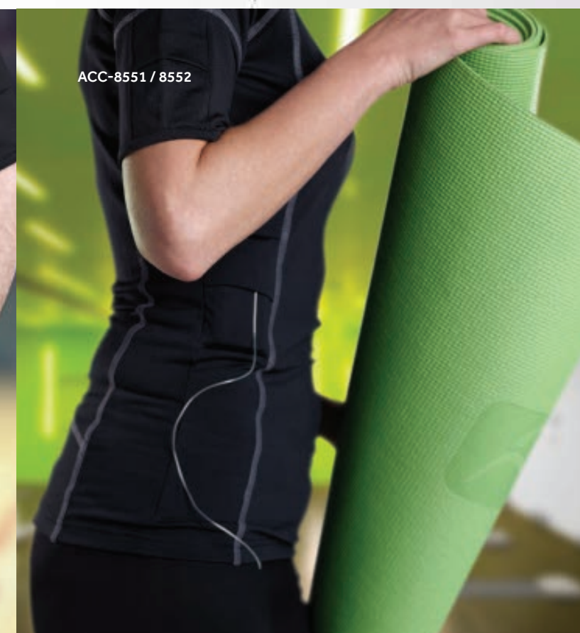
ACC-8551 / 8552